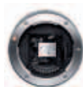
Lens change: dust particles have landed on the dust filter in front of the sensor.