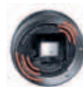
Activation of the ultra-sonic generator: the dust particles are shaken off.