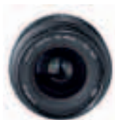
Attached lens prevents dust from entering.

sensor vibrates at ultra-high-speed so that dust and other particles are shaken off within milliseconds and are then captured on a special adhesive membrane within the camera. This function is invoked at each start-up of the camera as well as every time Pixel Mapping is carried out.