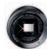
Clean image sensor: no dust particle can affect the image quality.